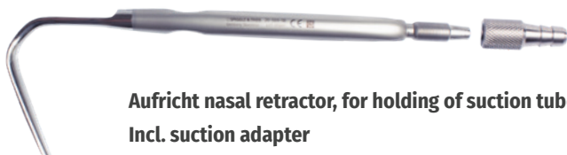
Aufricht nasal retractor, for holding of suction tube, 18.5 cm Incl. suction adapter 20-569-18