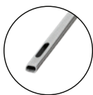
Suction tube with dual openings for optimized suction.