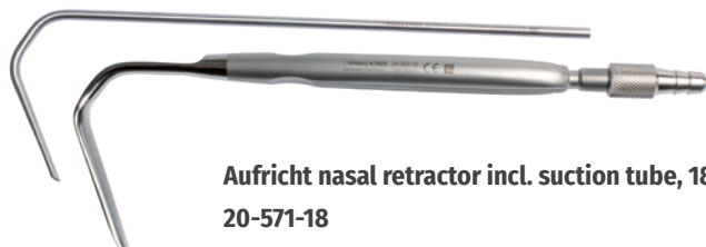
Aufricht nasal retractor incl. suction tube, 18.5 cm 20-571-18